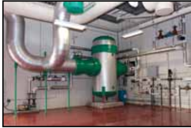
The 4900 Series Separator is a successful replacement for conventional separators which failed to perform adequately.

3,200 (pump design x 6), given the six Taco TA pumps.