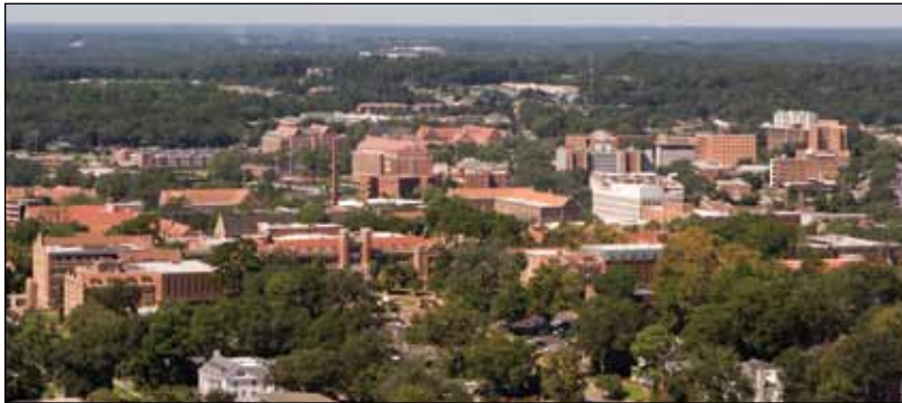
Florida State University Campus in Tallahassee, FL

Florida State University is a growing campus of almost 500 acres in Tallahassee, the state capital. As new buildings come on line the HVAC load to serve those buildings also requires expansion, which is why the school built a new satellite chiller plant in 2008. Located close by the school's medical school, the new satellite chiller plant comes with Trane supplied chillers, Taco pumps, and a custom built Taco 4900 Series Air-Dirt Separator, the biggest unit Taco has built to date.