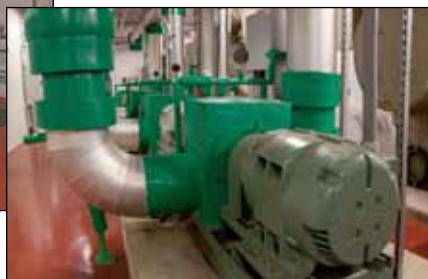
(Below) Taco TA pumps, multi-purpose valves and suction diffusers.

The satellite chiller plant is connected to the central energy plant and serves as a "stage" plant to provide chilled water for air conditioning needs on campus. It is connected through a 1 ½ mile underground piping loop. Equipped with three 1500 ton, 200 hp Trane centrifugal chillers (plus one as backup), the plant also comes with six 200 hp Taco TA pumps, multi-purpose valves, suction diffusers, a CA expansion tank and ABB VFD units to control the pumps.